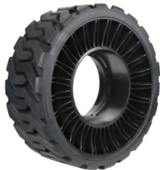
2-Piece Hub X TWEEL SSL shown without a hub adapter installed