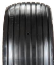
13" Grooved Polyresin Tread