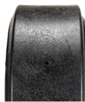
15" Smooth Polyresin Tread